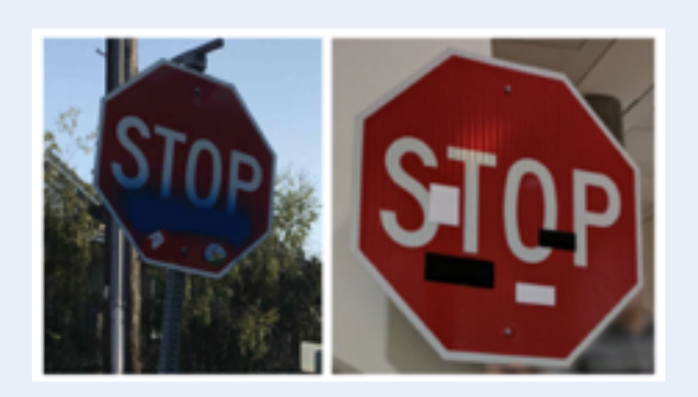
Figure 2. The left image shows real graffiti on a stop sign, something that most humans would not think is suspicious. The right image shows physical perturbations applied to a stop sign.

by placing small black and white stickers on each sign (depicted below).<sup>23</sup> This type of attack could cause traffic violations in systems such as those in autonomous vehicles. Similar evasion attacks have been demonstrated in a variety of other sensitive contexts as well.<sup>24</sup>