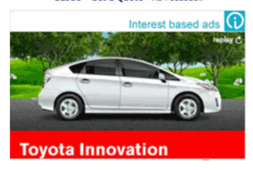
Figure 1: OBA disclosure icons "in context" on an ad. The AdChoices icon is on top, and the Interest based ads icon below.

ground in computer science or web development. We refer to our participants using codes representing the order in which they were interviewed (P-1 through P-48).