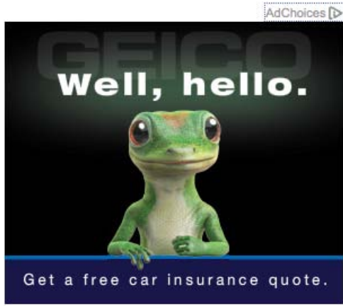
GEICO - Get a Quote - Ad Feedback